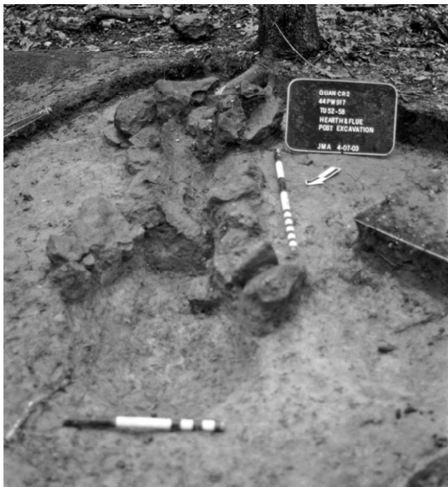
Hut hearth related to Site 44PW0917.

In the early to mid-20th century the area around what is today the Ravenscroft site was a very active African American neighborhood that included a church, a barber shop, a pool room, a hotel and several residences and businesses. The plethora of artifacts recovered from both the plowzone and the cellar that date to this period speaks directly of the descendant community of this neighborhood, many of whom are still active in the Williamsburg area. A major part of the Ravenscroft project involves gathering written, photographic and oral histories of the former neighborhood and will be an active part of the Public interpretation at the site this summer. For more information: http://research.history.org/Archaeological_Research.cfm .