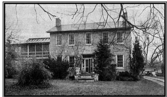
Plantation house built in early 19th century, (photograph courtesy of the Baltimore Sun [1967]).

In summary, the archaeological and archival findings revealed all of the history and reports of the oral testimony, recorded by archaeologists 20 years earlier, to be completely false. This preliminary investigation underscores the value of archaeology in confirming, contradicting, and/or contributing to our existing published history. The Connemara site investigation will be a multi-year project with excavations resuming this summer. Archaeologists will concentrate their studies on the backyard of the main house which includes a suspicious feature with a stone foundation and possible plaster floor, along with further excavations behind and along the rocky depression of the collapsed building. After excavations conclude this summer, SHA will focus their efforts on transforming the Connemara site into a public environmental classroom. Tentative plans include the installation of signage along a historical and biological interpretive trail that winds through the ruins and populations of native plants.