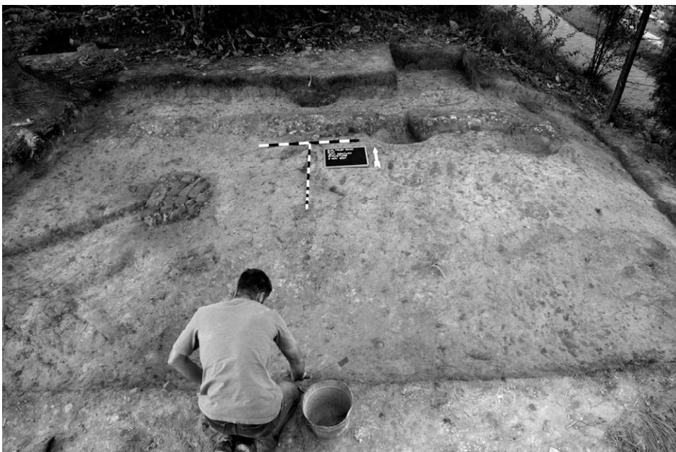
Robbed foundation and related features from the Sun Trust Site.

In 2006 the Department of Archaeological Research was given the opportunity to re-open the site as an exhibit dig for the visiting public and a venue for the field school – and perhaps to answer some of the mysteries sur-